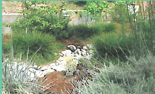
4910 Burgoyne Lane, La Canada