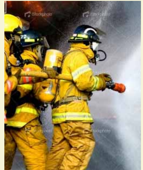
The Station Fire reminds us that we simply must rehabilitate our regional water system to ensure it can provide adequate water supplies during fires, electrical system breakdowns and other emergencies.

The program also will rehabilitate aging portions of the regional water supply system to ensure it can reliably deliver adequate water supplies during normal times and during emergencies such as fires, earthquakes or electrical power outages.